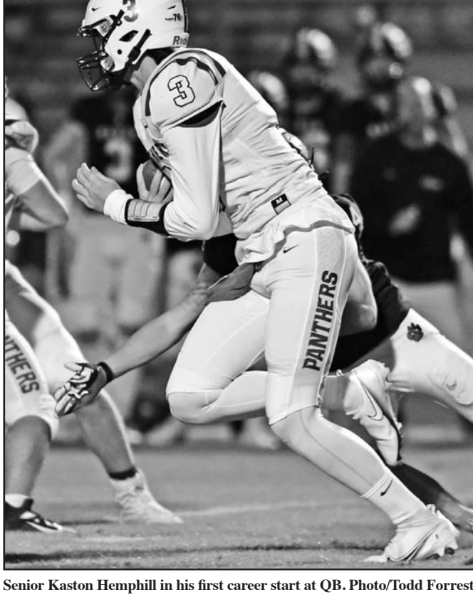
no gain, and the third-down play first score came on a 29-yard

The drive finally stalled in Wildcats' territory when Union's